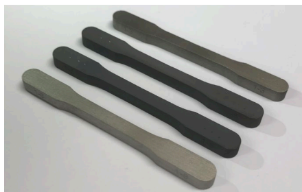
Hardened + Tempered

Specimens with subsequent process steps, bottom to top: as sintered, after hardening, after tempering and after blasting.